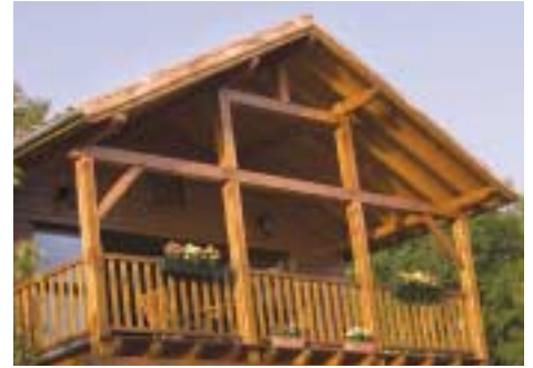
Above: Covered terrace of the 3 bed Rocamadour

The resort's experienced and knowledgeable property team can help guide potential owners through every step of the purchasing process - from advising on finance and purchase options (including the para hôtellerie scheme that enables the purchaser to recover the French government's version of VAT); to managing the actual purchase process and even helping to interior design and furnish your new home.