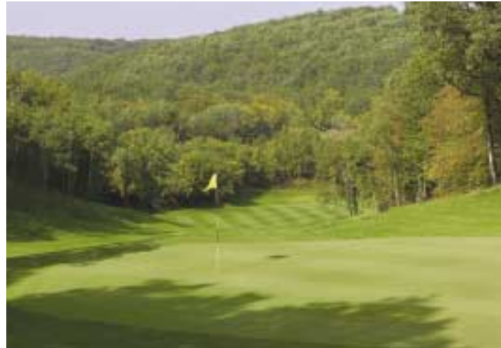
The 4th fairway, views of which will be enjoyed by residents of La Truffière

When purchasing a property on the resort, owners are automatically entitled to membership of Souillac Country Club and to make full use of all the club's facilities. These include a challenging 18 hole golf course set in and around ancient oak forests; an excellent clubhouse complete with superb restaurant and terrace bar; tennis and volleyball courts; heated pools; a driving range and putting green, and a children's play area.